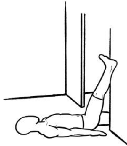
Hamstring stretch x1 per day 1-2 min Left + Right

Clinic 38 Collins Street Rehab Studio 129 Argyle Street www.bodysystem.com.au 03 62 31 5991