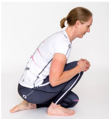
Short calf muscle stretch x1 per day 1-2 min Left + Right