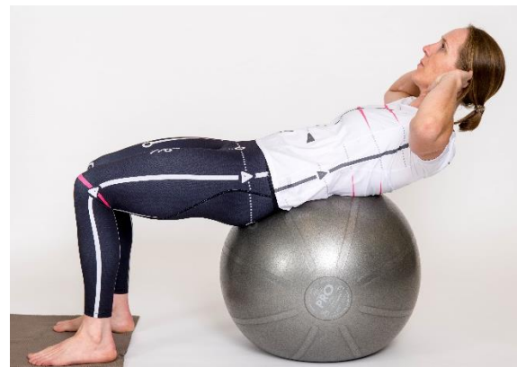
Short range crunches (shoulders off ball) 2x20 > 3x30 > 4x40 x3 per week

Glut and hip flexor stretch best done after rowing / erg when body is warm