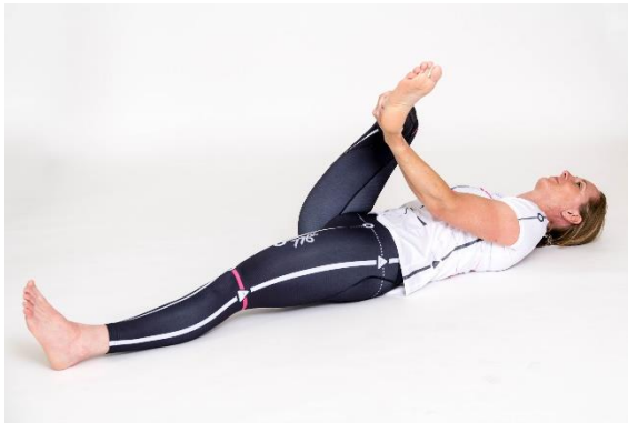
Glute stretch x1 per day 1-2 min Left + Right